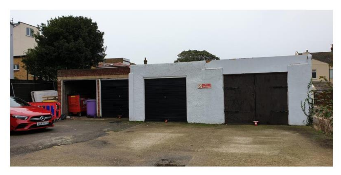
Garage block to be demolished