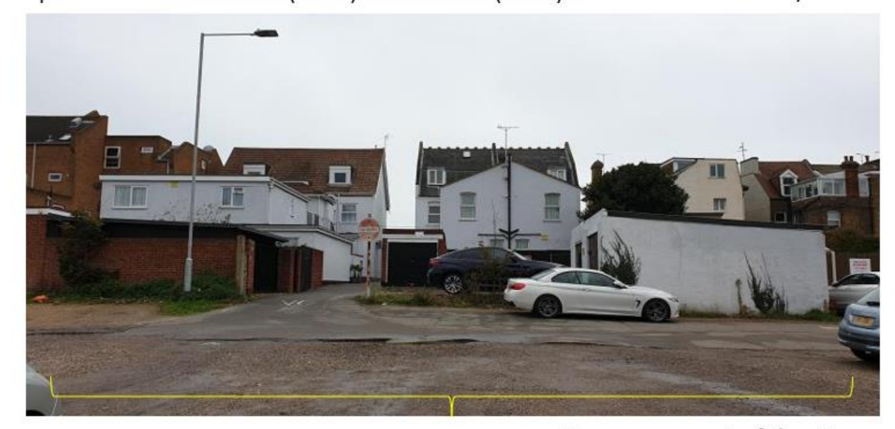
Garages are part of the site