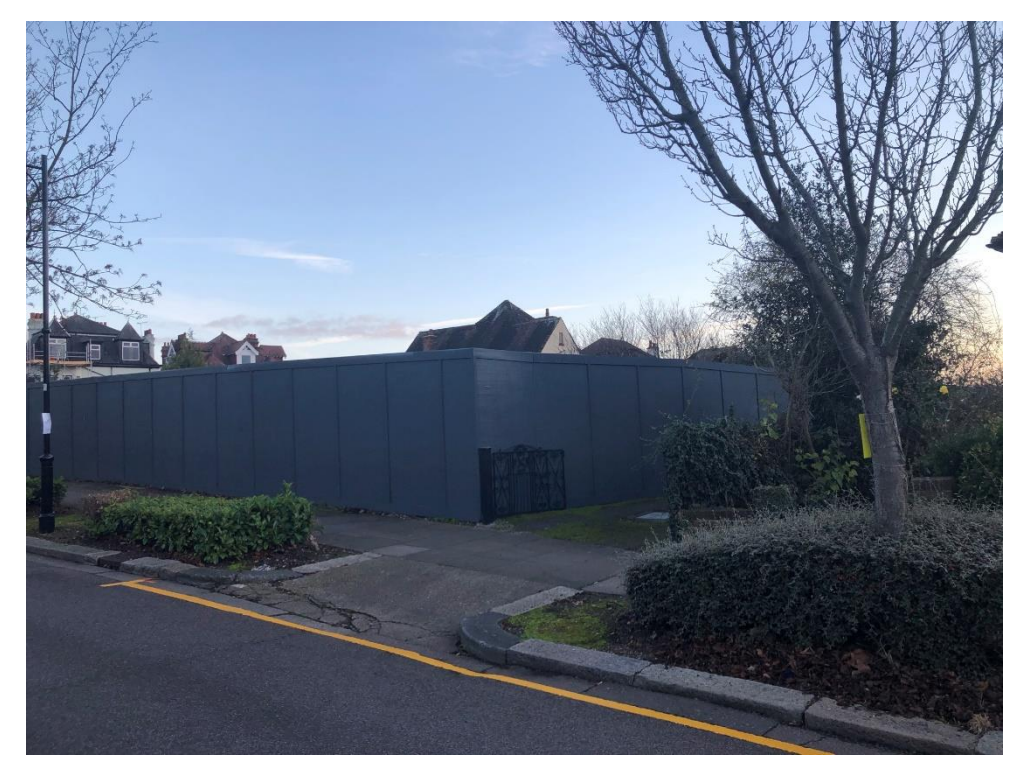
Appendix 1 – Photographs for Agenda Item 5 - 20/01612/OUT – 6 Crosby Road and 121-123 Crowstone Road, Westcliff-on-Sea